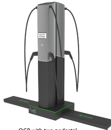
QCB with two pedestal mount chargers