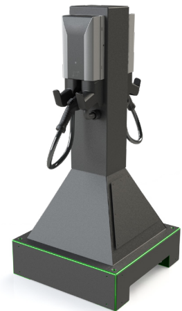
QCB with riser and two wall mount chargers