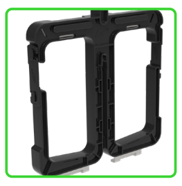
Slim Profile Easy to handle