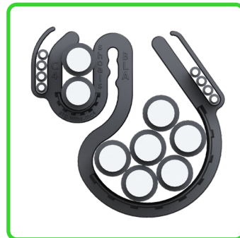
STG.WMS.MH4 example wire layout